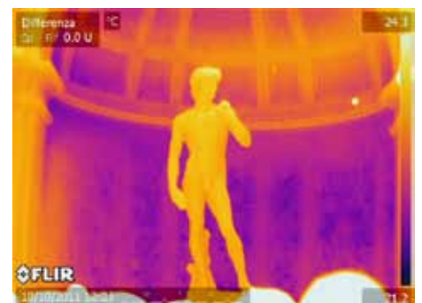
This thermal image reveals the underlying texture of the walls and pillars of the apse in which Michelangelo's David is placed.