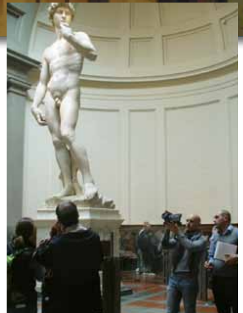
Inspections with the FLIR SC660 thermal imaging camera can help preserve cultural heritage.

Thermal imaging cameras record electromagnetic radiation in the infrared spectrum, which is emitted by all matter as a function of its temperature. The onboard electronics use the recorded intensity of infrared radiation to generate a thermal image and to calculate temperatures. In other words, each pixel in the thermal image is in fact a non contact temperature measurement. A thermal imaging camera can be used to find sub-surface cracks, water damage and many other building issues. It records radiation, no radiation is emitted. This means that there is no risk on damaging the building. "Frescoes and sculptures are often very fragile, so regular building inspection techniques can cause them to deteriorate. That is one of the reasons why we use thermography."