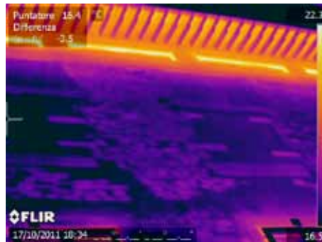
Evaluation of the infill masonry between the Accademia Gallery and the cloister of the Academy of Fine Arts.

damage the plaster or fresco. Also we can detect the presence of mold below the surface. The thermal imaging camera can also be used to check the state of adhesion between plaster and the underlying structure or to detect hidden cracks and the presence of infill, or spot previous renovations and hidden structures, but also detect damage caused by an earthquake for instance. We investigate convective airflows around works of art that can cause the art to deteriorate if left unchecked and give advice on changes in the heating and ventilation systems to avoid this. We also study the process of disintegration of building materials, particularly the calcarenite - or dune limestone - that is often used in historical buildings in this area. On the outside of the building we also check for the buildup of anthropogenic surface deposits caused by pollution."